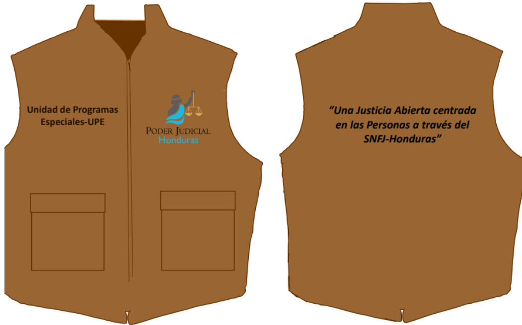
Fleece vest with embroidered logo