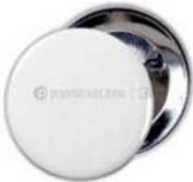
Metal pins for sublimation