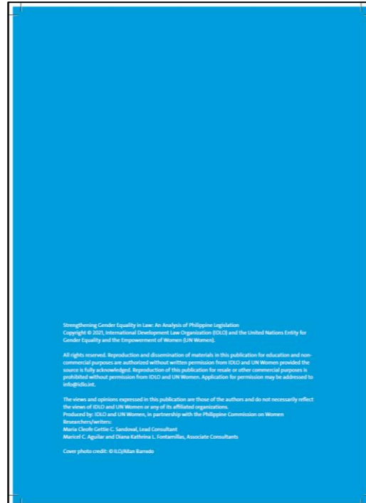
Inside Cover Page