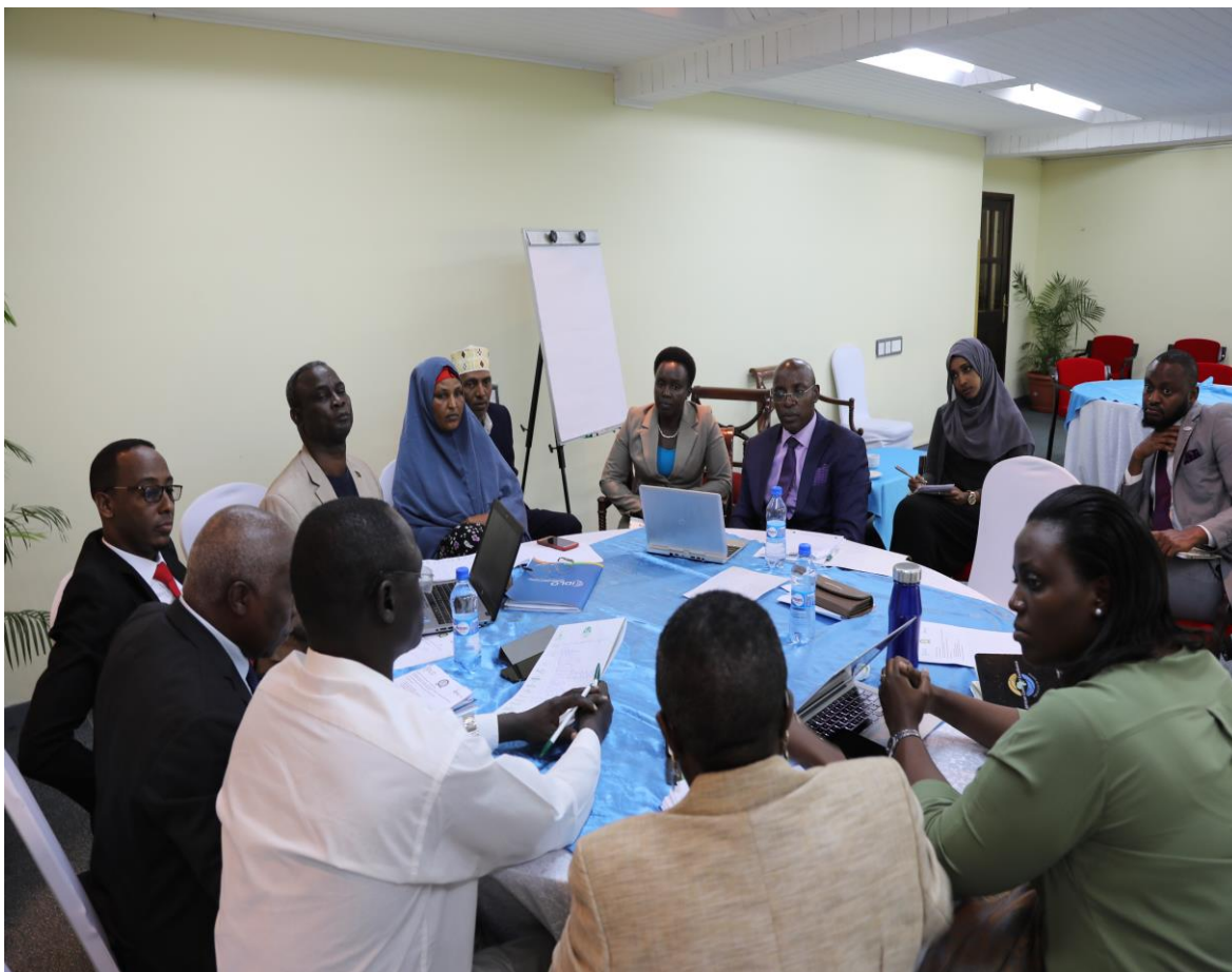
Delegates taking part in one of the breakout sessions.

the need to revisit the system of legal education. The review of the system, it was proposed, should elevate the role and value of ADR and CIJ within the justice system. This should be coupled with fighting the stigma that characterizes AJS as repugnant to justice and morality.