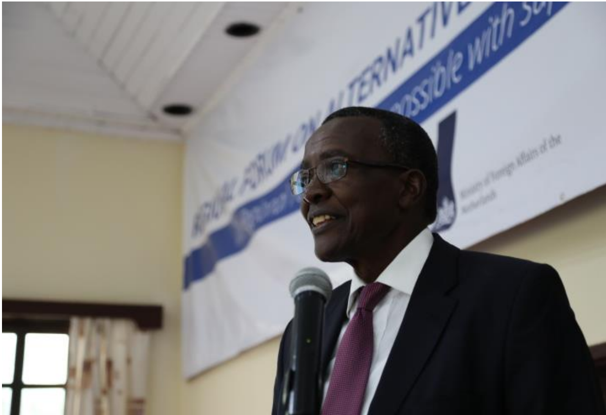
Hon. David K. Maraga, Chief Justice and President of the Supreme Court of Kenya, giving the keynote address at the opening of the Forum.