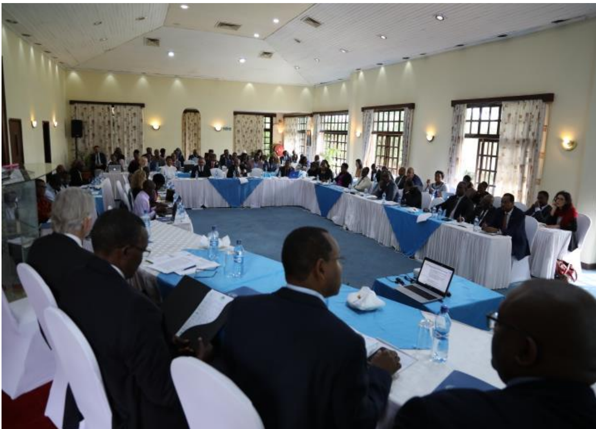
Delegates during the Regional Forum at Safari Park Hotel in Nairobi 2-3 March 2020.